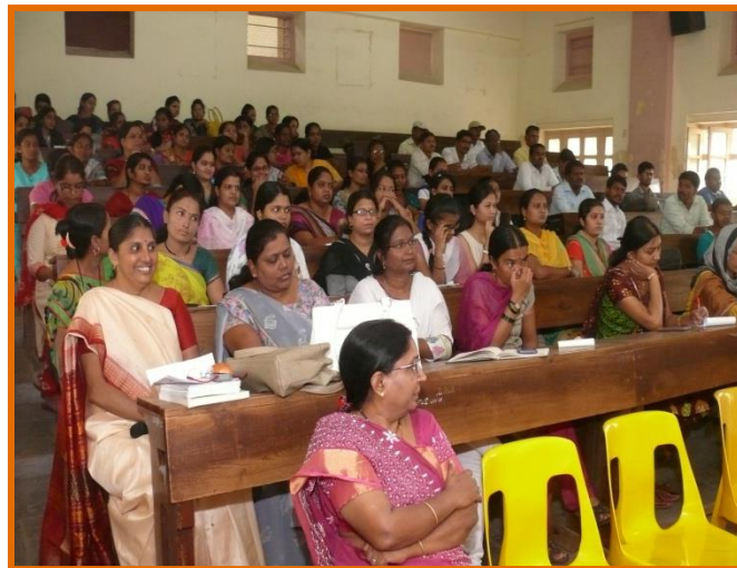
96 Participant Delegates at the One Day Workshop on 'Net /Set Guidance' 19 th April, 2016