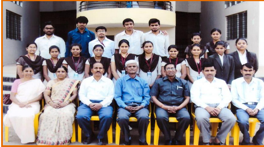
23 Students of Sangameshwar College from BCom, BBA and BSC selected at a Campus Drive of Infosys, Bangalore on 6 th February, 2015