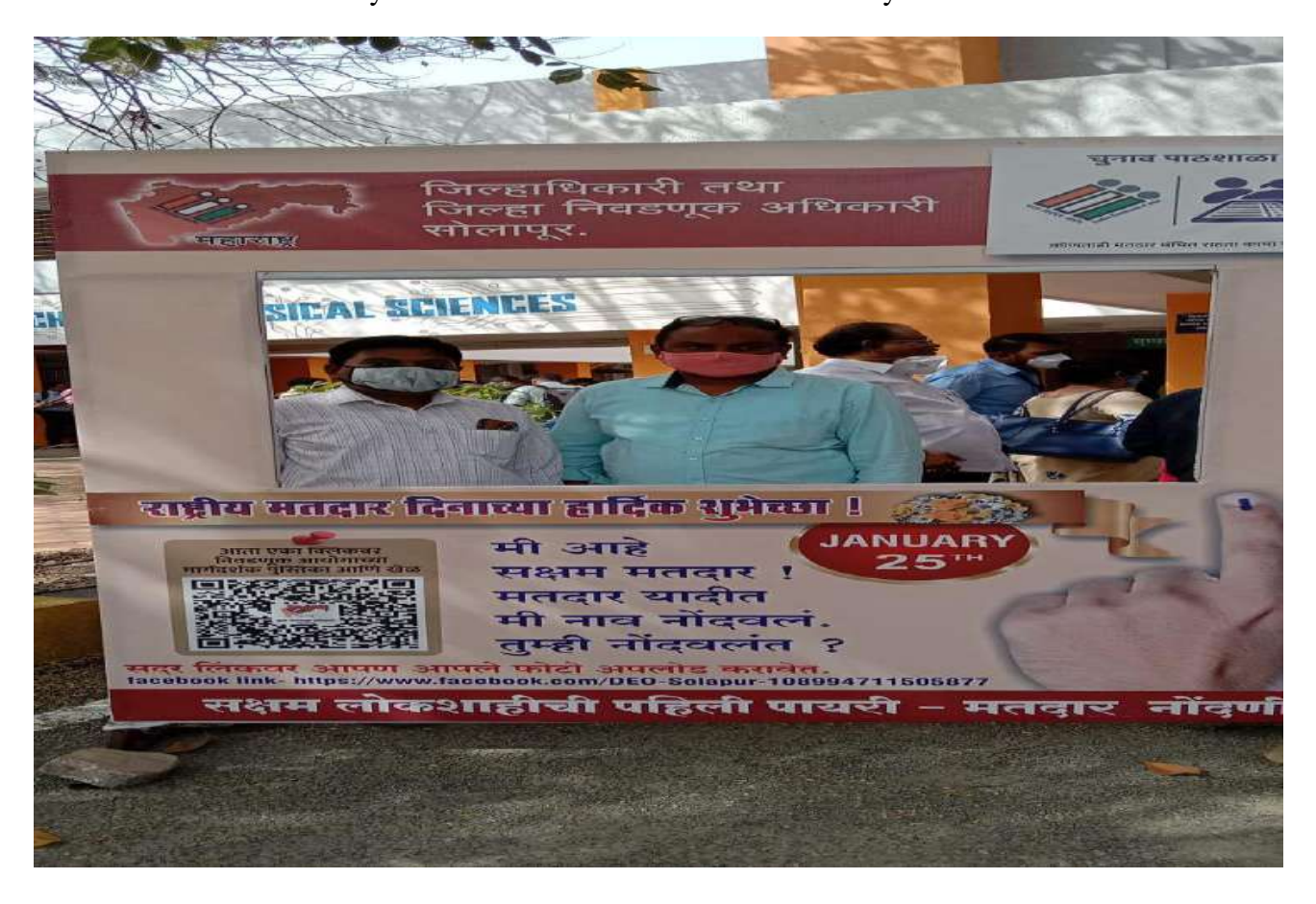
NSS Volunteers and Faculty members at the time. National voters day