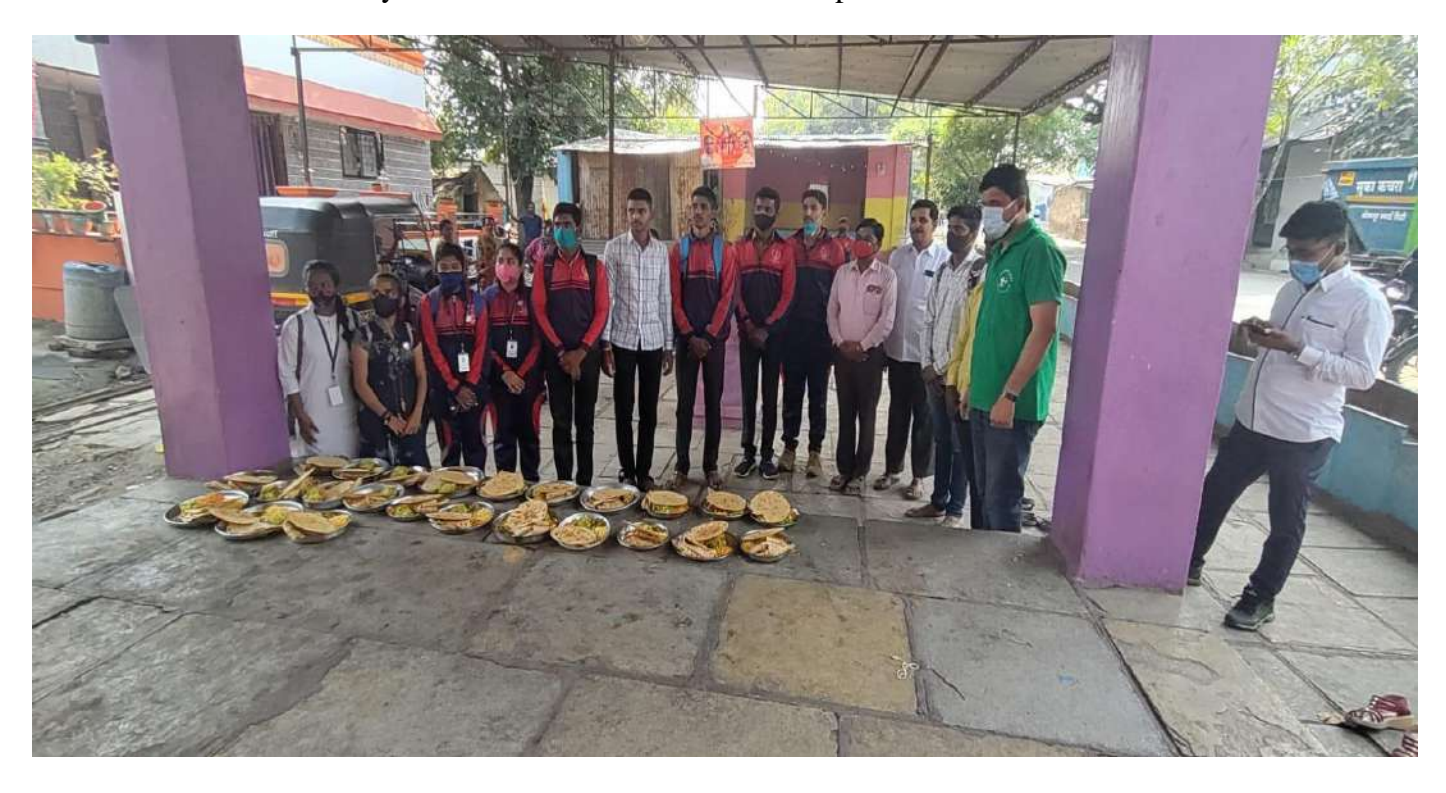
NSS Volunteers and Faculty members at the time Roti Bank Upkram & Annadan