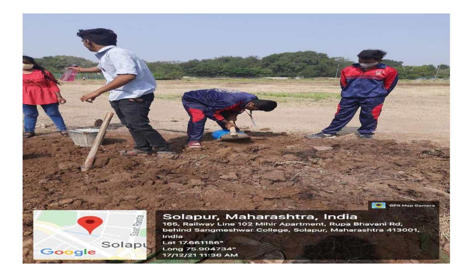
NSS Volunteers and Faculty members at the time. Swachyata Abhiyan