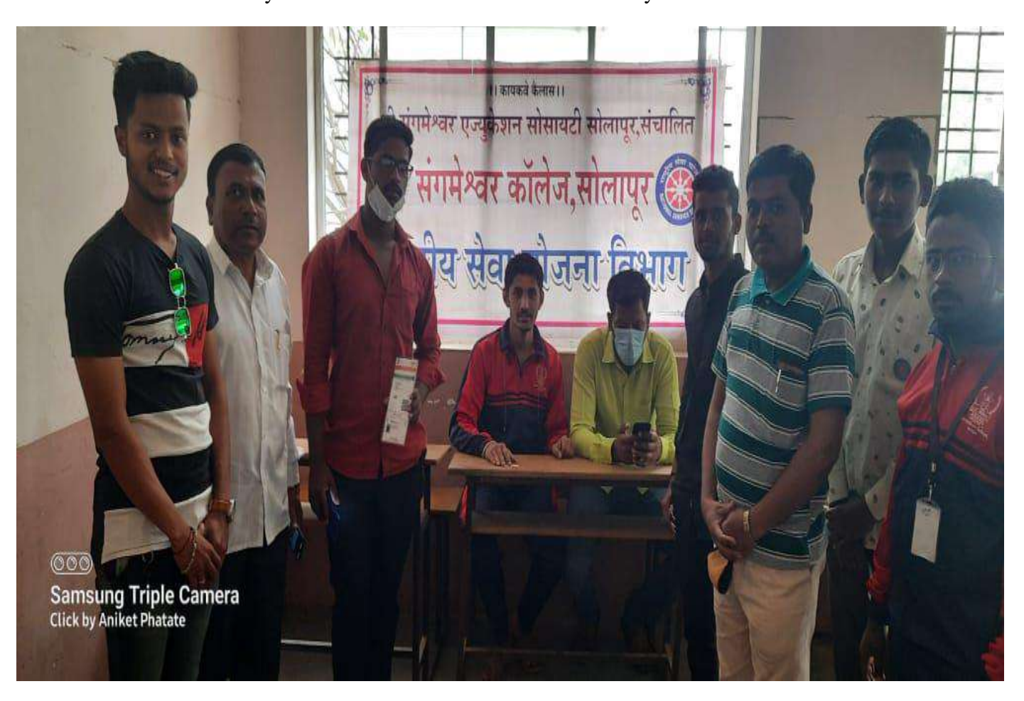
NSS Volunteers and Faculty members at the time. National voters day