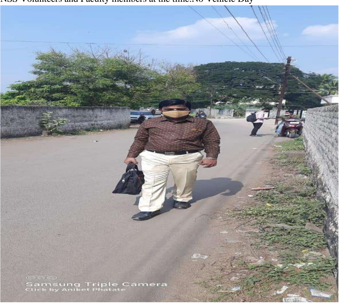
NSS Volunteers and Faculty members at the time.No Vehicle Day