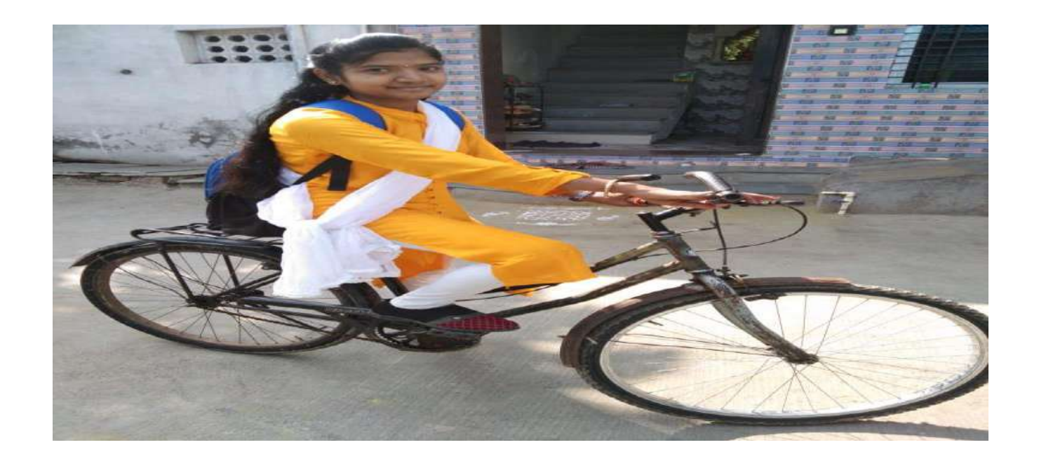
NSS Volunteers and Faculty members at the time. NSS Volunteers participated in Cycle Rally Organised by Hindustan Petrolium