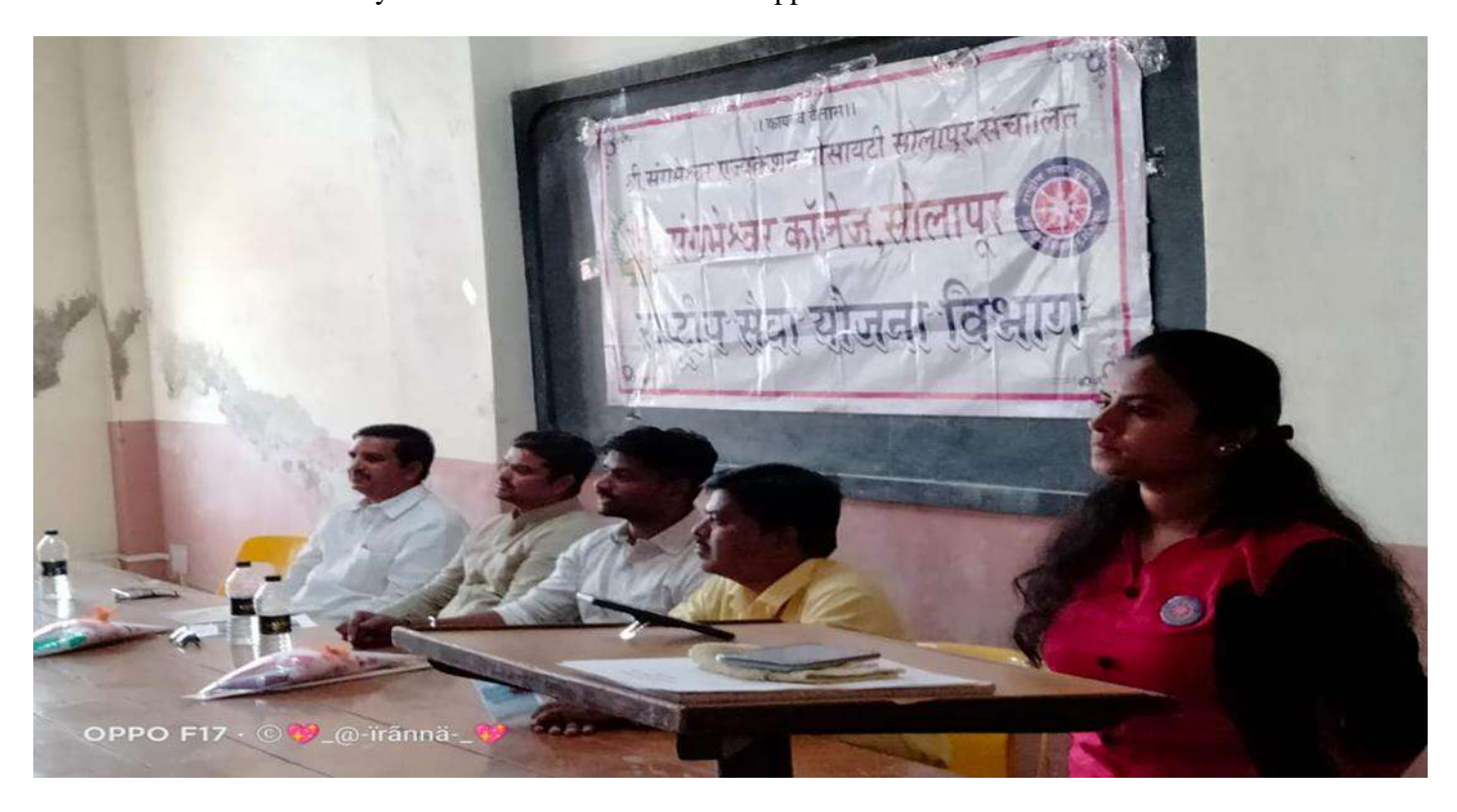
NSS Volunteers and Faculty members at the time.Career Opportunities