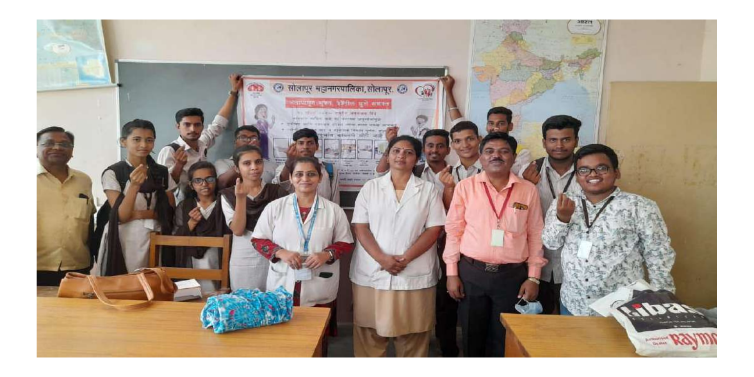
NSS Volunteers and Faculty members at the time. Jant Medicines Distribution to Students