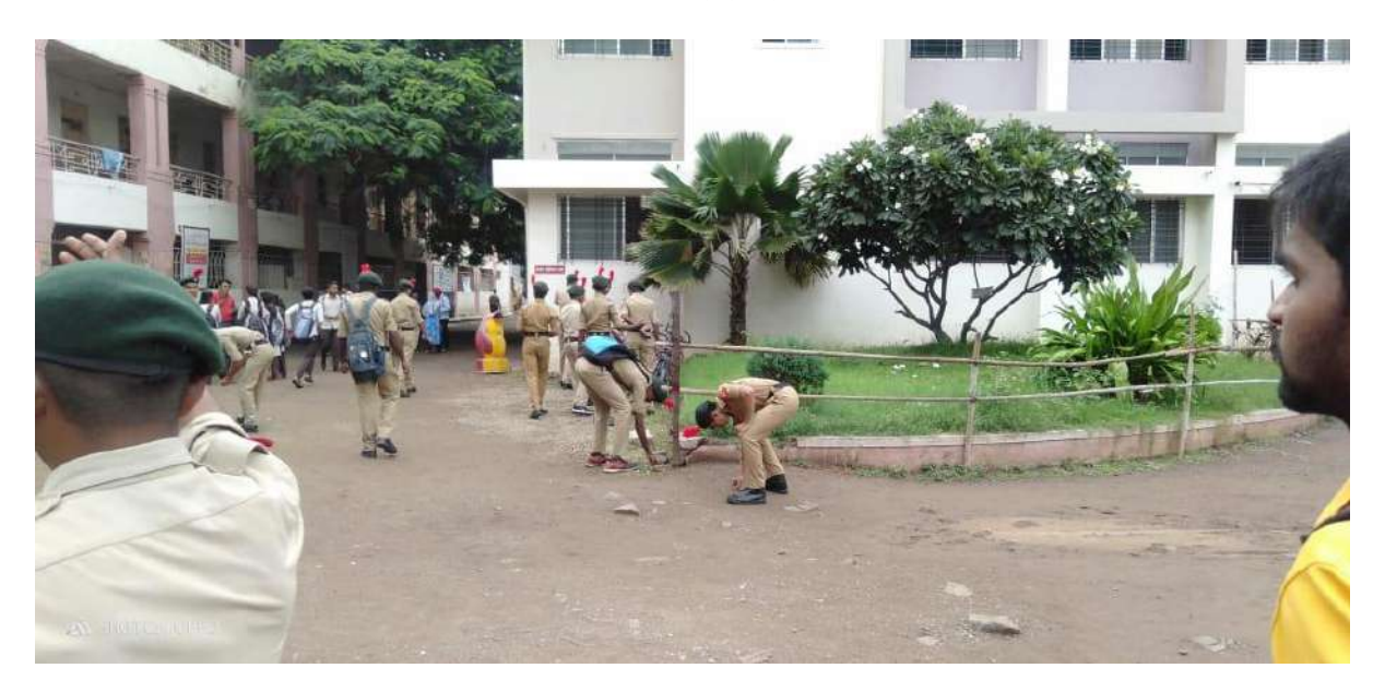
Cadets cleaning campus