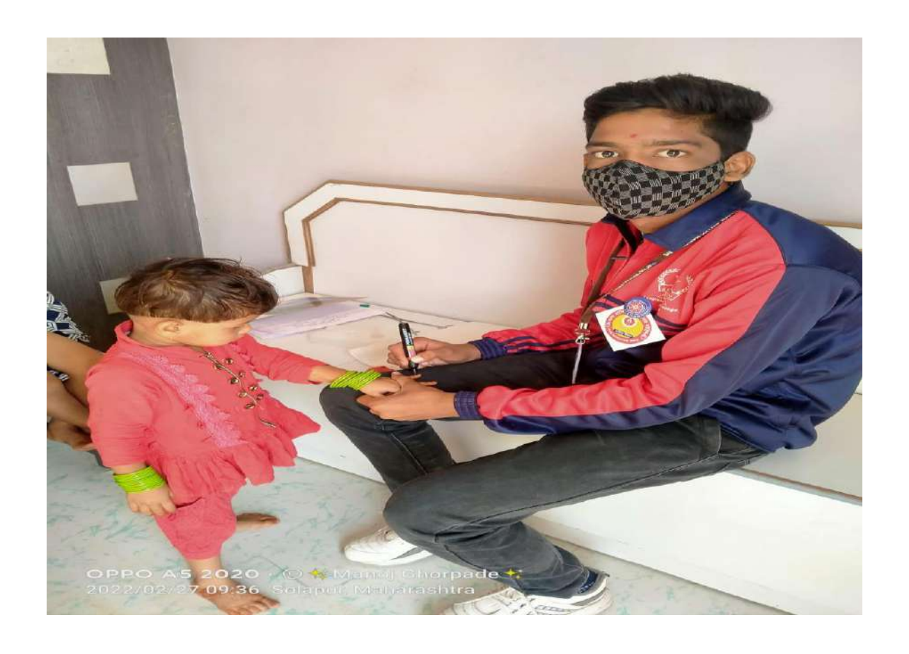
NSS Volunteers and Faculty members at the time. Puls Polio Abhiyan