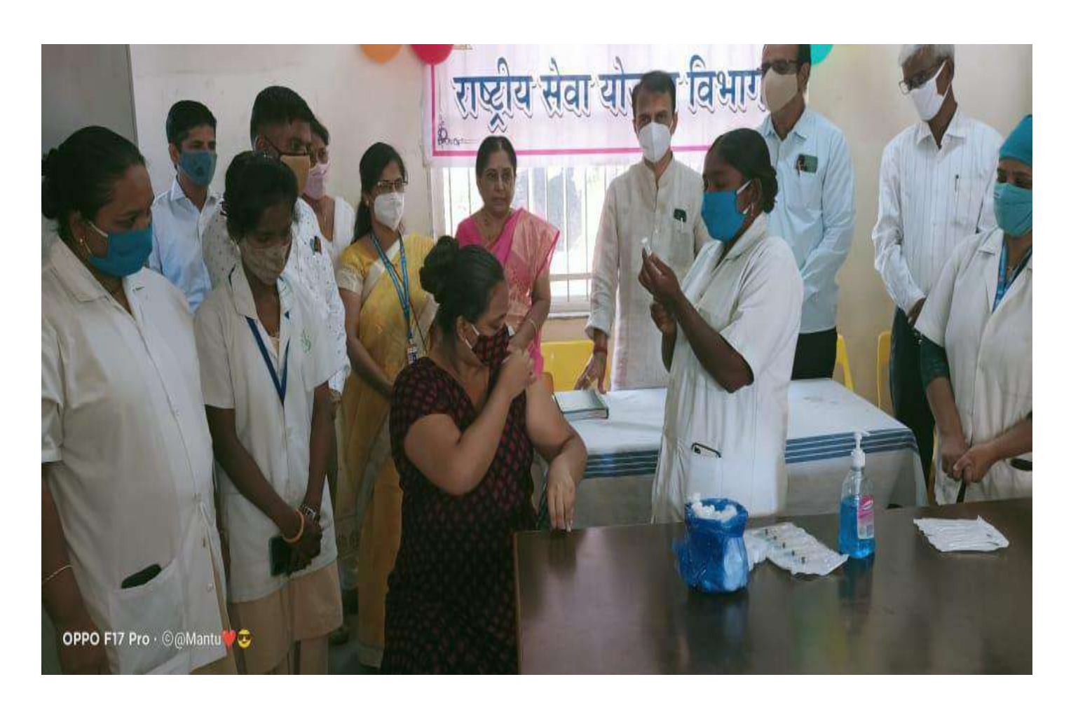
NSS Volunteers and Faculty members at the time Covid Vaccination Camp for (15 to 18 Age Students)