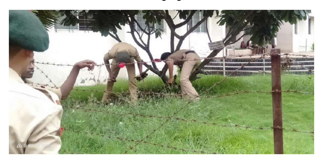
Cadets collecting paper wastes