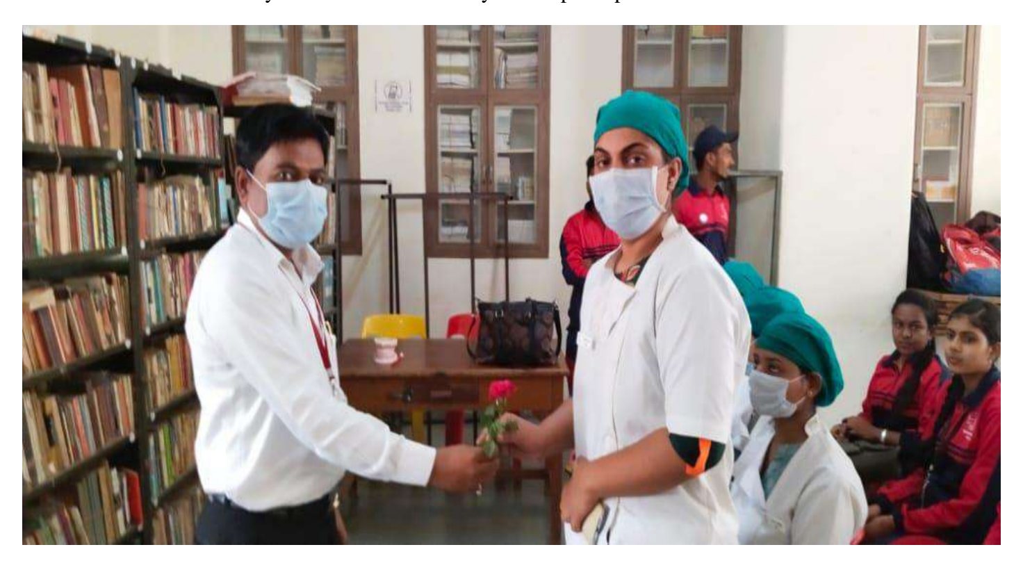
NSS Volunteers and Faculty members at the time Eye chekup camp