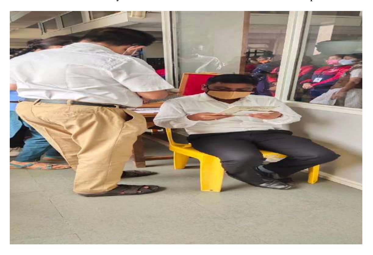
NSS Volunteers and Faculty members at the time of Covid Vaccination Camp