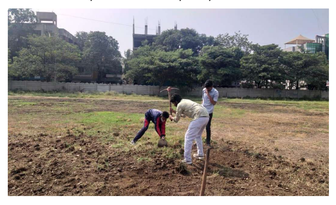
NSS Volunteers and Faculty members at the time.Swachyata Abhiyan