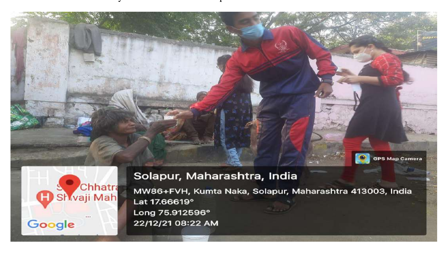
NSS Volunteers and Faculty members at the time. Aapulkicha Chaha