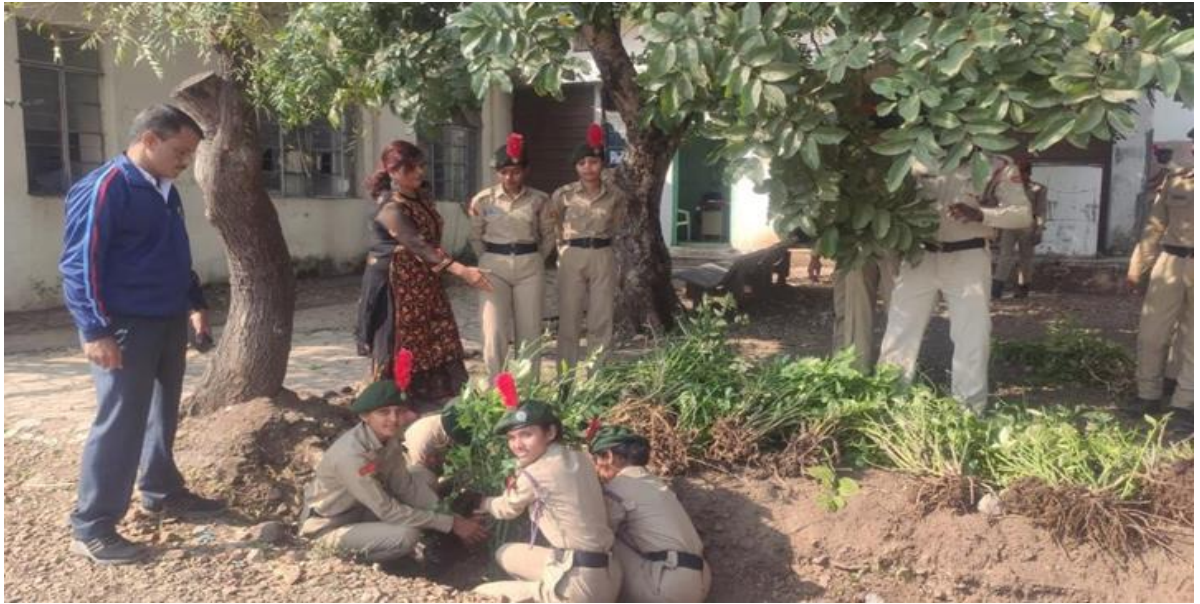
NCC Cadets in tree plantation programme