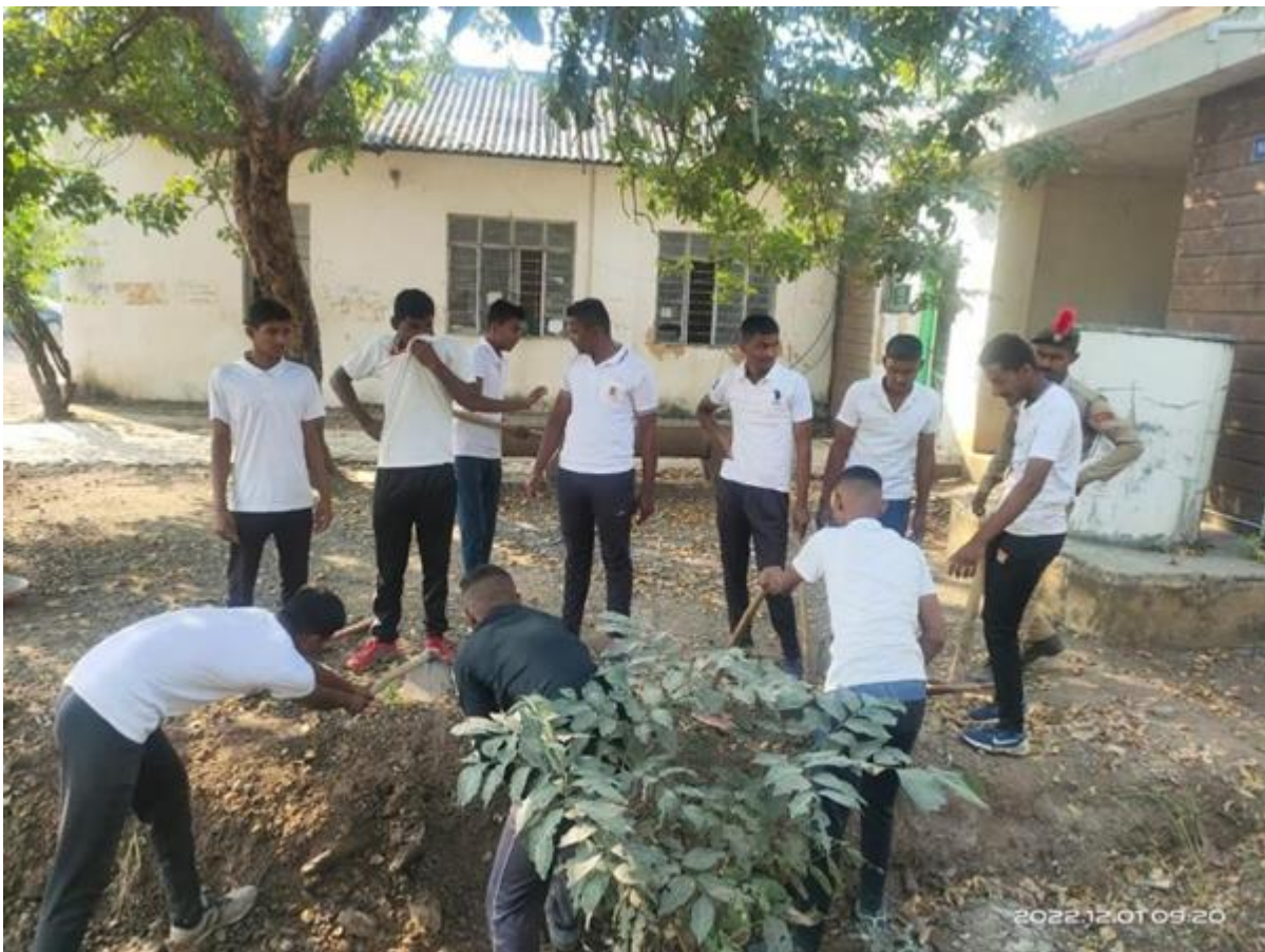
NCC Cadets with Planting stock